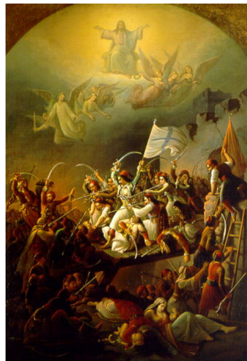
Theodore Vryzakis; The sortie of Messolonghi . The painter was inspired by the Greek War of Independence .

Μέσα στις θαλασσινές σπηλιές μέρες ολόκληρες σε κοίταξα στα μάτια και δε σε γνώριζα μήτε με γνώριζες